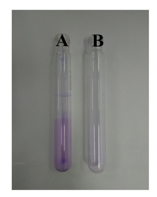
The susceptibility of multidrug resistant and biofilm forming Klebsiella pneumoniae and Escherichia coli to antiseptic agents used for preoperative skin preparations at zonal referral hospital in Mwanza, Tanzania

Tube method as previous reported by Karigoudar et al.,<sup>11</sup> was used for detection of biofilm formation. A loopful (10µl) of test bacteria from overnight cultures were inoculated in 4 ml of tryptic soy broth (TSB; Liofilchem, Italy) containing test tubes and then tubes were incubated aerobically at 37°C for 24 hours. After 24 hours of incubation, tubes were decanted, washed with phosphate buffer saline (PBS, pH 7.3) and allowed to dry in the inverted position at room temperature. The interior of dried tubes were stained with crystal violet 0.1% for 1 minute followed by washing with distilled water to remove excess stain and then dried in the inverted position at room temperature. Each isolate was tested in duplicate to confirm test results. Presence of visible film lining the wall and bottom of the tubes were interpreted as positive biofilm formation and absence of visible film lining the wall and bottom of the tubes were interpreted as negative biofilm formation (Figure 1).