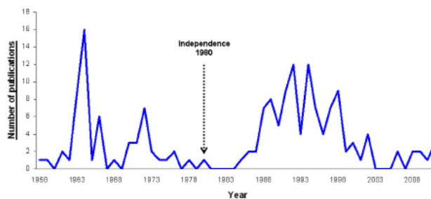
Figure 1. Number of publications from Mpilo Central Hospital per year from 1958 – August 2011, showing two distinct 'peaks' in publication (before and after Zimbabwe's independence).

The full research dataset for this study is shared (Supplementary appendix – available from author), which shows that most of the scholarly output from Mpilo Central Hospital reported little external funding.