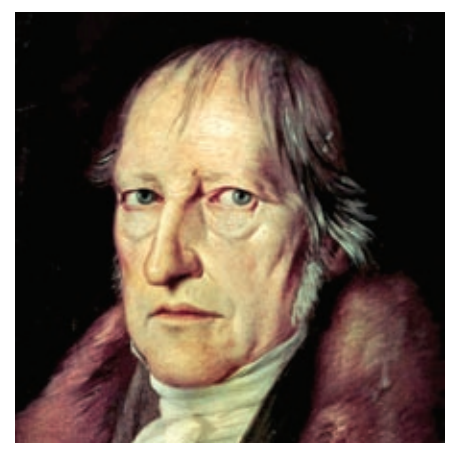
Georg Wilhelm Friedrich Hegel

The Marxian contribution to the Hegelian dialectic was to highlight or reify the "temporal" disunity of the subject and object as an actual occurrence in history: in capitalist production, the labourer (subject) is alienated from the fruits of his labour (object), paradoxically sowing the seeds for a revolution leading to the ideal/synthesis of socialised labour. The antagonism between subject and object must be conjoined, with the