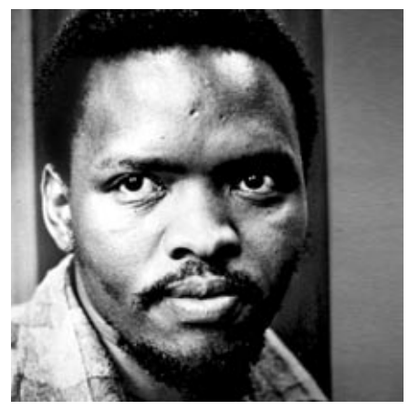
Steve Biko

one issuing out of the other, a negative instigating its positive. This "causal" connection is also emphasised by Merleau-Ponty: