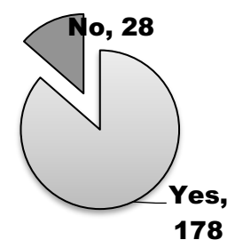
Figure 2: Decision if changes occurred during wood extraction