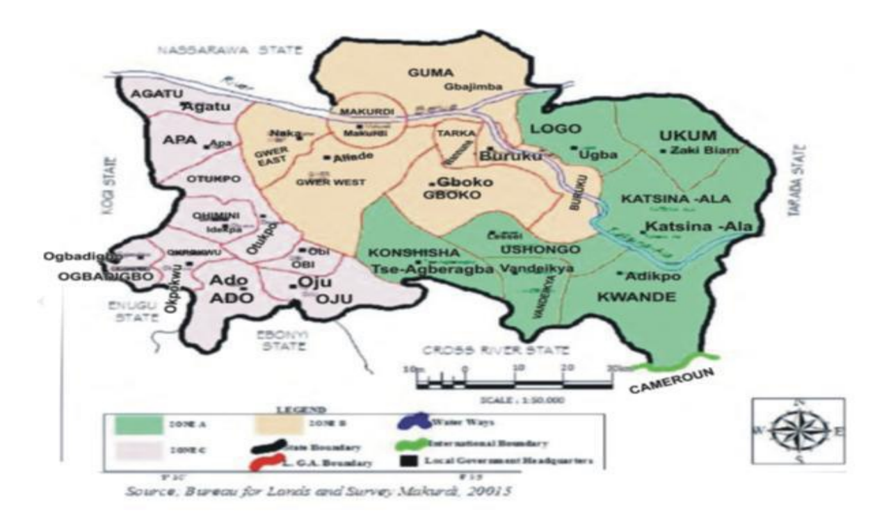
Fig. 1: Map of Benue State showing distribution of local government areas by zones