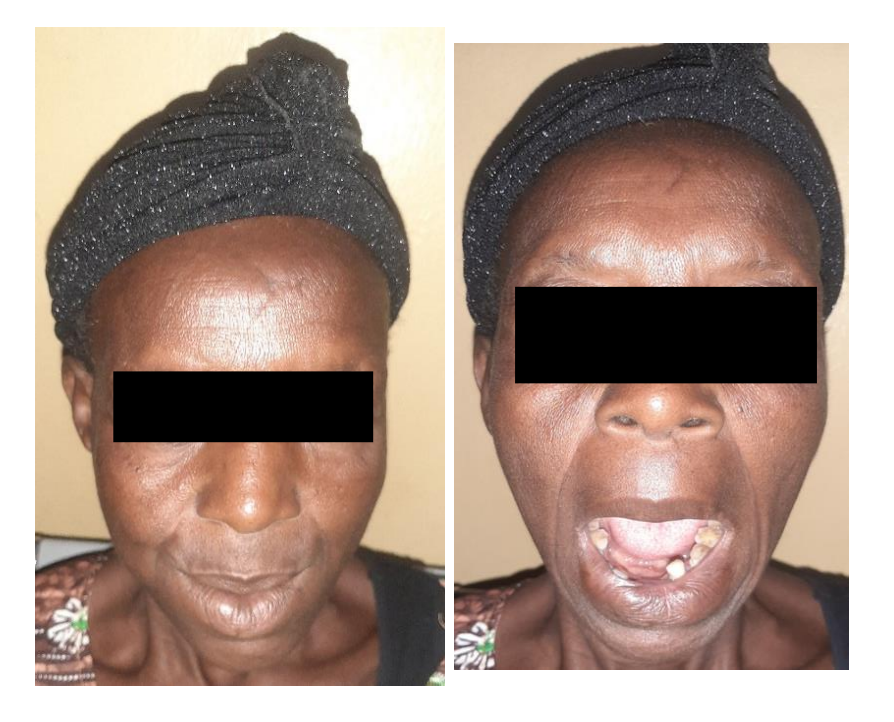
Figure 1: Pre-operative photographs (closed and open position) with protruded mandible

On examination, her mouth was open, and there was significant saliva drooling. Her face appeared unusually longer because she was in a class III skeletal relationship (figure 1).