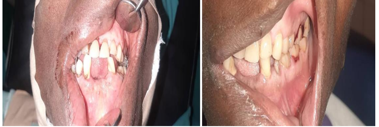
Figure 4: intra-op reduction with IMF, 4b: post op without IMF

thereafter placed on inter-maxillary fixation for 2 weeks. She has had several reviews post reduction and the outcome has been satisfactory (figure 4).