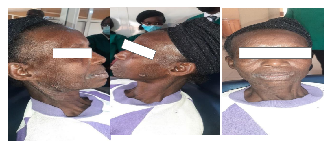
The stab wounds healed satisfactorily and no complication was recorded (figure 5). Figure 5: Postoperative photographs