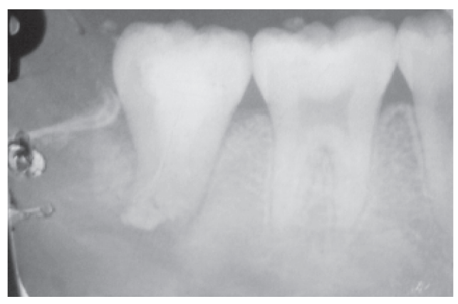
Figure 2b showing root filled mandibular left second molar in Case 1