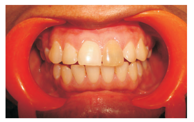
Figure 8: Grayish brown discoloration in the upper left central incisor due to pulpal hemorrhagic products

symptomless tooth, known as the 'Pink tooth of Mummery'. The resorption may be internal, being of pulp origin or external of periodontal origin <sup>(62, 63)</sup>.