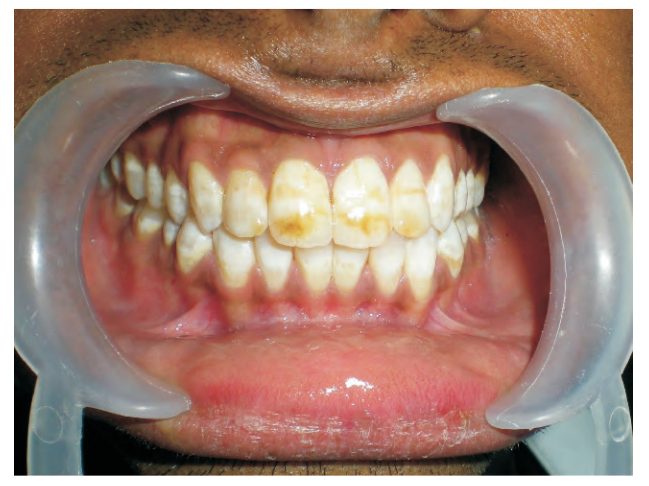
Figure 6: White opaque and brown discoloration as a result of fluorosis