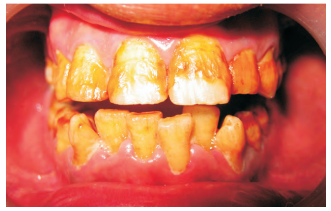
Figure 4: Generalized yellowish discoloration with rough enamel surface in amelogenesis imperfecta