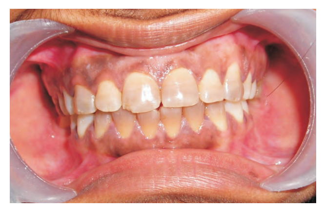
Figure 5: Brown-gray discoloration due to tetracycline.