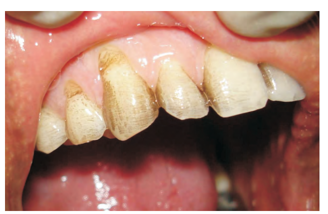
Figure 3: Extrinsic black stains due to high concentration of iron in the water source