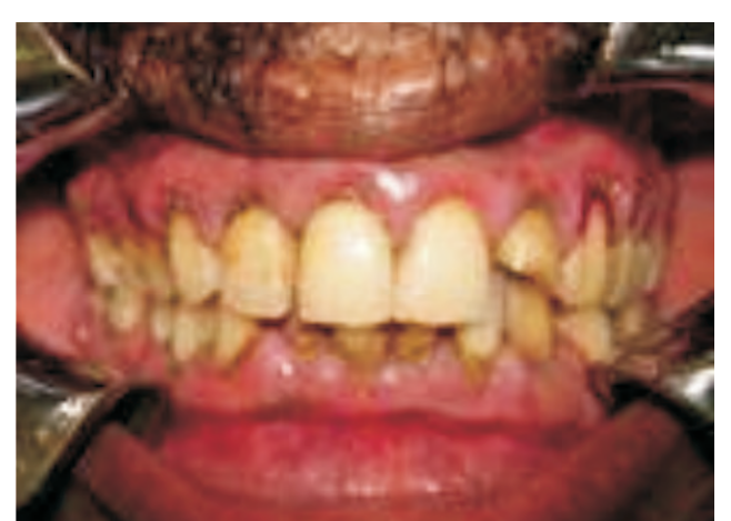
Figure 1: Extrinsic yellowish brown stains due to the accumulation of plaque and calculus

Minocycline is a semi-synthetic derivative of tetracycline. Its prolonged ingestion can lead to green-gray or blue-gray intrinsic staining of the teeth. Unlike with other tetracyclines, minocycline causes staining during and after the complete formation and eruption of teeth. Four theories have been proposed to explain the possible mechanism of this side effect. The first is the extrinsic theory, where it is thought that minocycline attaches to the glycoprotein in acquired pellicle. It oxidizes on exposure to air or as a result of bacterial activity. This results in the degradation of the aromatic ring forming insoluble black complex. It is possible that the pigment is incorporated into the dentin by a demineralization/remineralization phenomenon. The second is the intrinsic theory, where the minocycline bound to the plasma proteins is deposited in collagen-rich tissues, such as the teeth. This then oxidizes slowly over time with exposure to light. The third possibility is that the drug chelates with iron to form an insoluble complex. The fourth suggestion is that minocycline could be deposited in dentin during secondary dentinogenesis and the process can be accelerated in bruxists (16-18, 50).