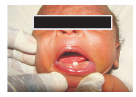
Figure 1. Clinical photograph of a 6 day old infant showing natal and neonatal teeth in the mandibular anterior region.

Histological examination was carried out following extractions. They were fixed in 10% formaldehyde for 48 hours. Following a decalcification process by 10% formic acid, routine pathological tissue examination was undertaken. Cross-sections having 5-micron thickness were taken from the paraffin blocks and stained with were taken from the paraffin blocks and stained with hematoxylineosin (HE). The sections were evaluated under light microscope. Light microscope examination shows a mass of dentine comprising loosely packed dentine tubules surfaced in areas by enamel matrix. Pulpal areas showed cells consisting of plumped shaped fibroblasts, vascular channels and inflammatory cells predominantly neutrophils as seen in (Figure 4). These were consistent with imparture teeth with immature teeth.