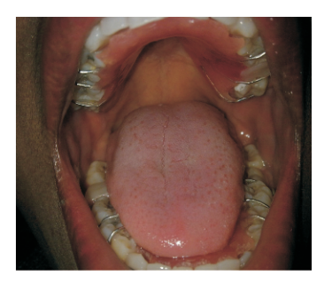
Figure 4. Modified upper and lower Hawley retainers in place in patient's mouth.

Figure 3. Modified upper and lower Hawley Retainers with pink acrylic bases and upper left first molar and lower right second molar acrylic stock teeth fabricated to act as retainers and partial dentures.