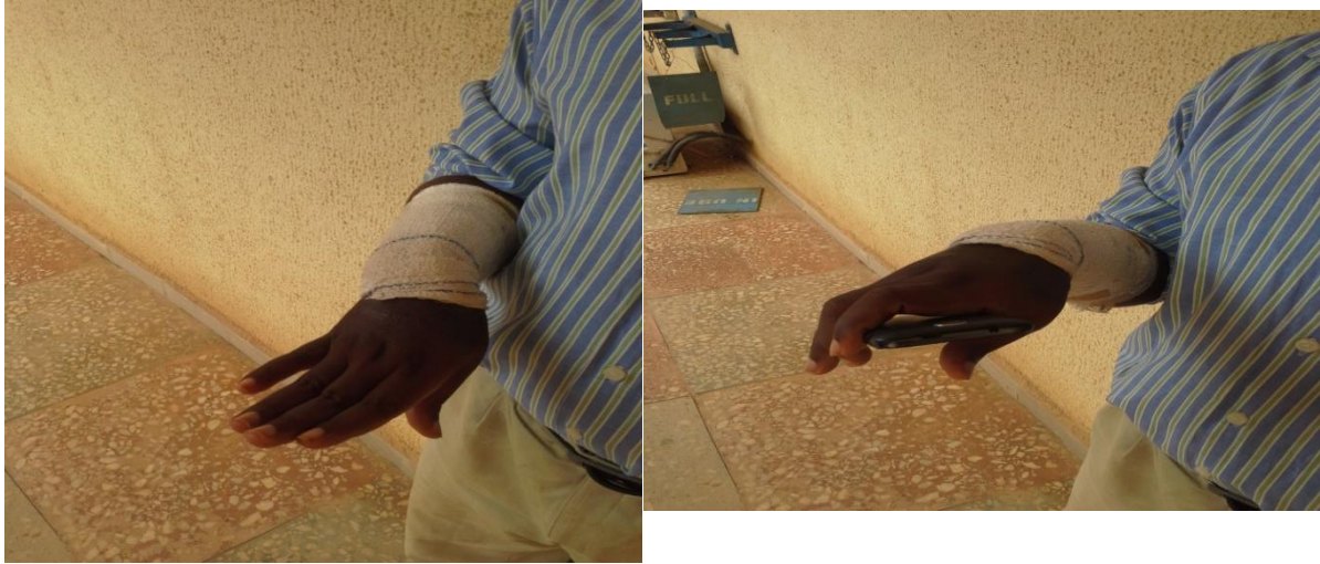
Figures 6 and 7 showing post operative hand and wrist function