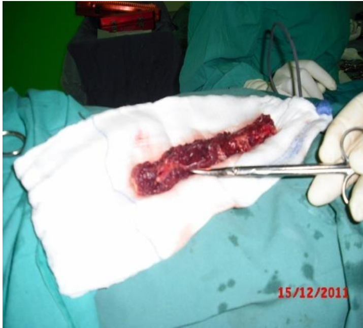
Figure 3. Free Fibular Graft

On follow-up at 6 months, wound had healed completely, the wrist was stable and flexible, and function was good. A check radiograph showed good callous formation at the proximal and distal fixation (Figures 4, 5, 6 and 7).