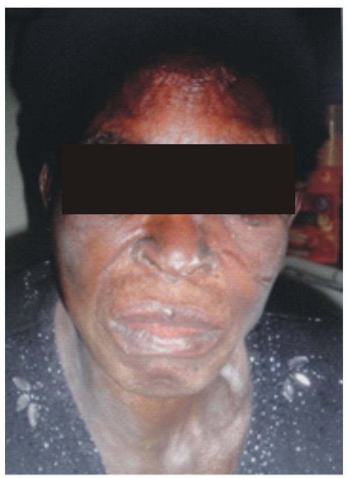
Figure 1 –Hypopigmentation and salt and pepper rash on the face

days after commencement of steroids. She died in the course of treatment from cardiopulmonary insufficiency.