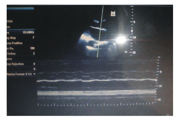
Figure 3 – Echocardiography showing dilated left atrium and thickened pericardium.