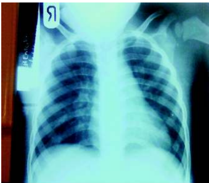
Figure 4: Chest X-Ray Taken After 3 months Of Treatment