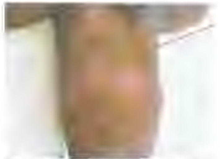
Figure 1: Showing Pectus Excavatum deformity

The patient has completed 9 months of intensive and continuation phase of anti-tuberculosis therapy with rifampicin and isoniazid. The repeat and interval repeat chest x-rays done at three months showed significant interval change indicating resolution of the tuberculous pneumonia (Figure 4). The child weight and other anthropometric and haematological parameters also indicate a resolution. No significant change has been observed in the pectusexcavatum. The patient did not experience any significant drug adverse effects in the course of treatment. He is still undergoing regular follow up at the paediatric and orthopedic clinic.