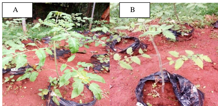
Plate 1: (A) Tropimech treated with 0.0% SA concentration showing many leaves

LSD – 0.74. Means with the same letter within the same column are not significantly different.