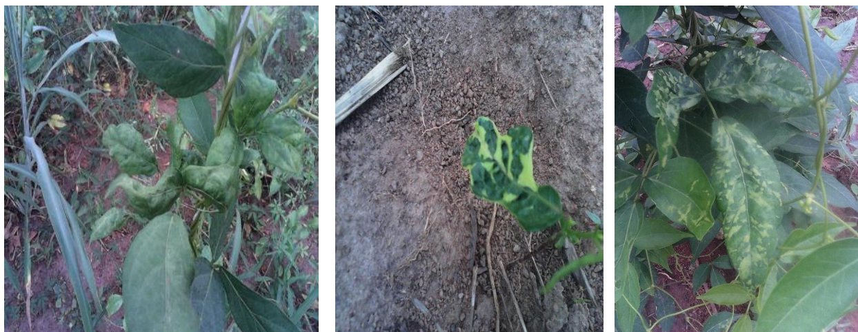
Plate 1: Characteristic viral symptoms observed on African yam bean leaves