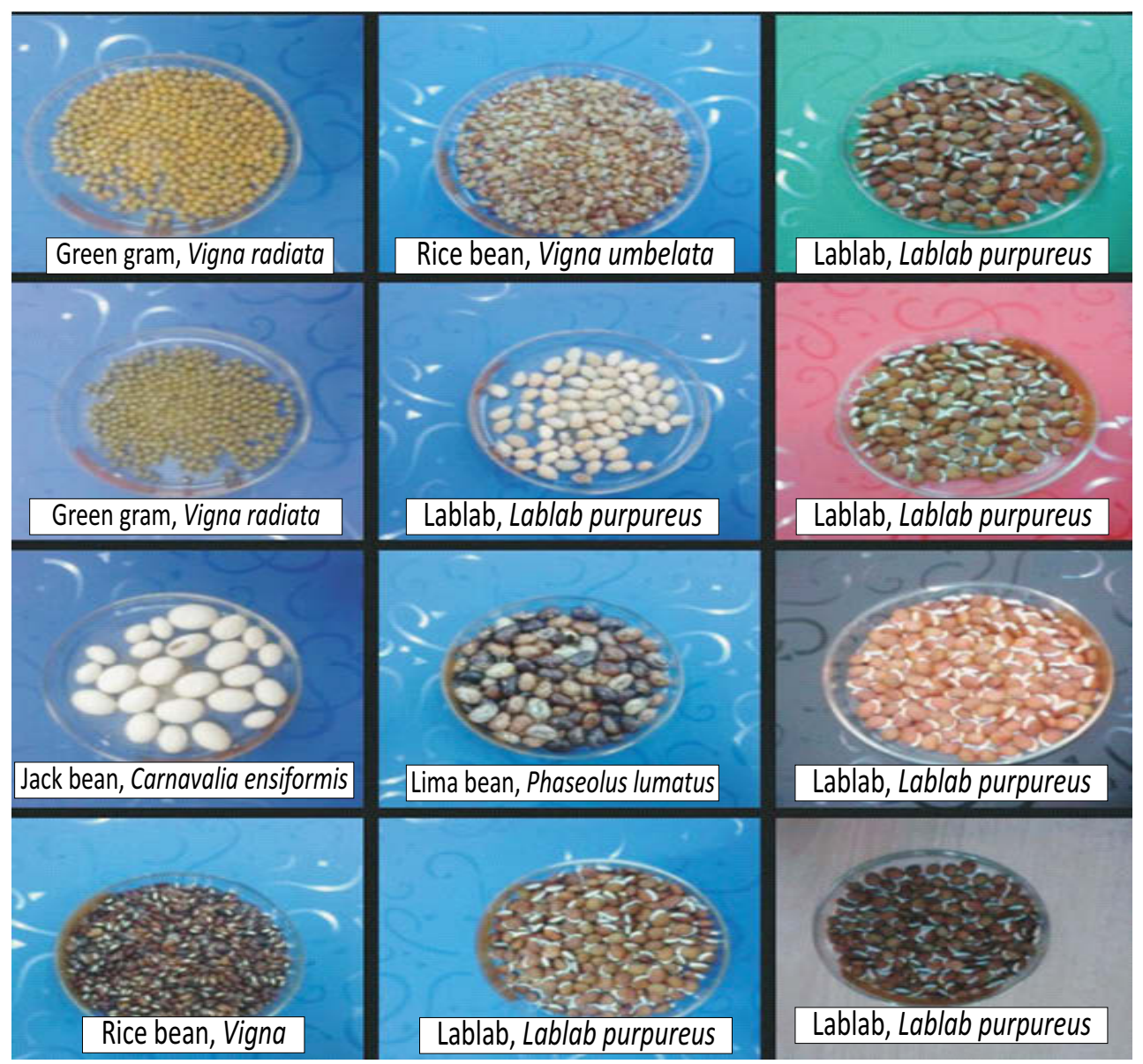
Plate 1: Variation in colour and seed size of some of the legumes studied.