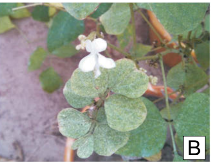
Plate 2: Flower colour and morphology of [ A ] rice bean (Vigna umbelata) and [ B ] Lablab bean (Lablab purpureus).