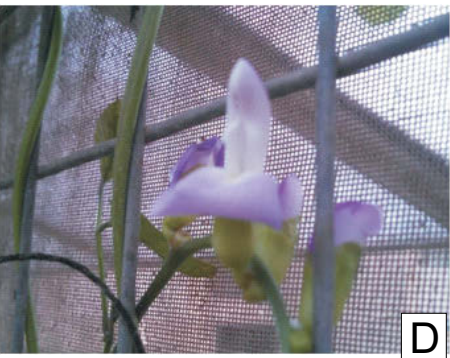
Plate 3: Flower colour and morphology of [C] lima bean (Phaseolus lunatus) and [D] Jack bean (Canavalia ensiformis).