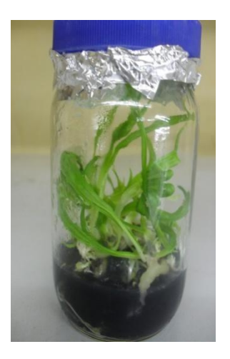
Plate 10: Shoot development from matured somatic embryos.