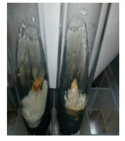
Plate 4c: fungi contamination on explant culture after few weeks from the day of inoculation.