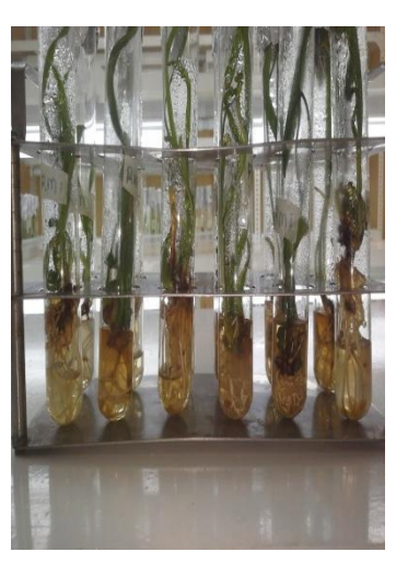
Plate 12: Rooted plantlets under pre-acclimatization process.