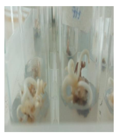
Plate 7: Somatic embryos development from the embryogenic calli after few weeks of subculture into fresh media .

isolated and cultured (Plate 8) in a suitable medium. Some of these embryos multiplied slowly, others (Plate 9) proliferated almost indefinitely with the mature ones concurrently developing shoots. The shoots were isolated for multiplication and elongation (Plate 10 & 11) and later rooted using MS medium supplemented with NAA (0.1mg/L) (Plate12)