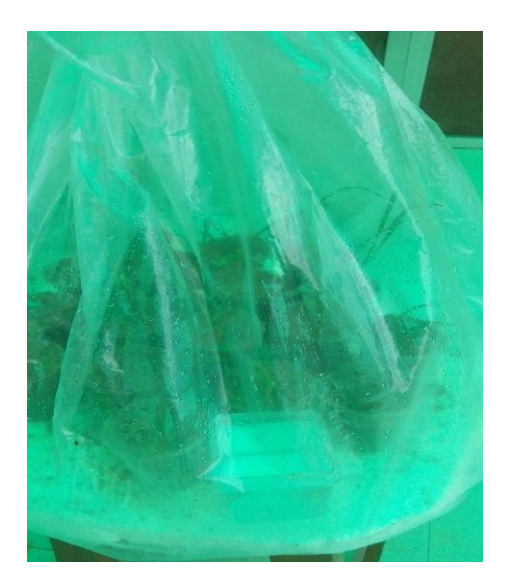
Plate 13: Plant acclimatization stage under controlled humidity and temperature.