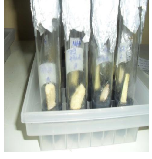
Plate 3: Inoculation of shoot tips immediately after dissection into culture media containing growth regulators at different concentrations