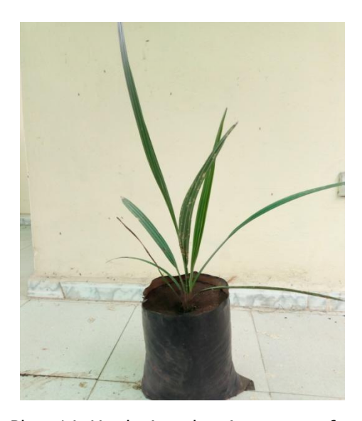
Plate 14: Hardening plant in nursery after successful acclimatization process.

The use of ethanol, sodium hypochlorite and mercuric chloride had different effects on decontamination of the explants. The ineffectiveness and harmful effects of ethanol on decontamination of plant tissues have been observed by other researchers like Hammond et al. (2014) who recorded 100% contamination when 70% ethanol was used alone in the sterilization of sweet potato explants. Similarly, Sen et al. (2013), studying seed germination of Achyranthes aspera in vitro reported 100% contamination when ethanol alone was used for sterilization and that ethanol was more harmful to the explants. Furthermore, Osterc et al. (2004) also reported low germination rates when 70% ethanol was included in the sterilization of Pinus sp. There are many reports of surface sterilization in plant tissue culture using HgCl<sub>2</sub> (Sen et al 2013). However, exposure to HqCl<sub>2</sub> may have negative effects on