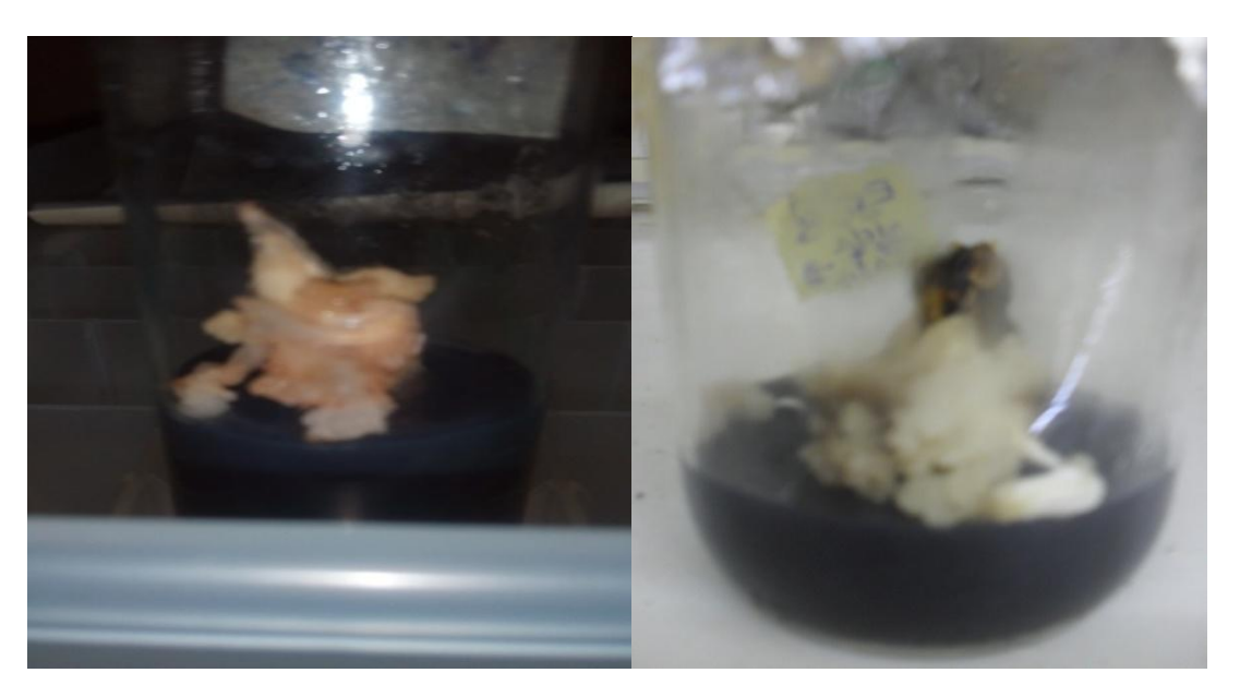
Plate 5a and 5b: Embryogenic callus and somatic embryogenic response after three months of subculture into fresh media

Callus multiplication and somatic embryos development