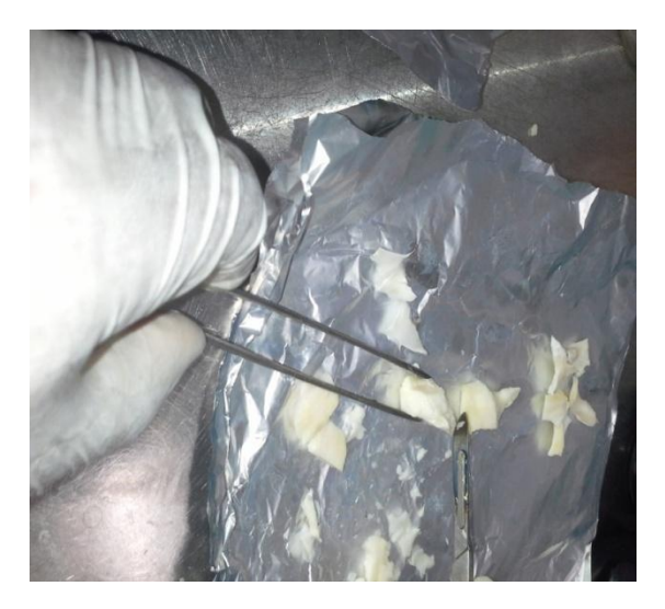
Plate 2: Trimmed Shoot tip explants after sterilization to expose the meristem.