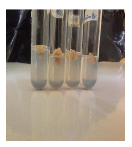
Plate 6: Embryogenic callus responses from the initiated explant subcultured into multiplication medium for further multiplication and development.

The callus obtained multiplied in a medium containing MS basal salts supplemented with growth regulators (NAA, kinetin and BAP) (Plate 6). The somatic embryos (Plate 7) that resulted from the embryogenic calli were