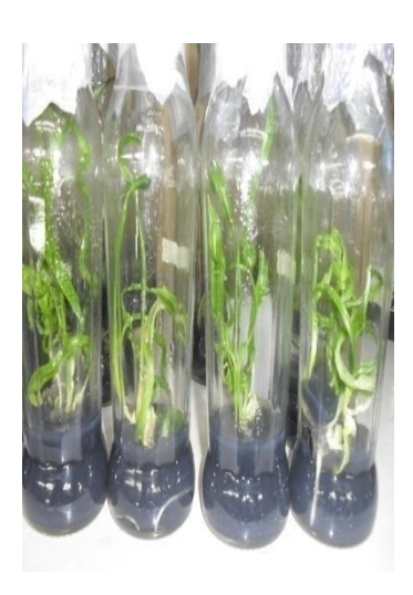
Plates 11: Shoots elongation stage showing well developed plantlets.