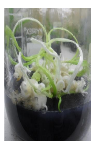
Plate 9: Embryos multiplication with shoot development after two subcultures into fresh medium.