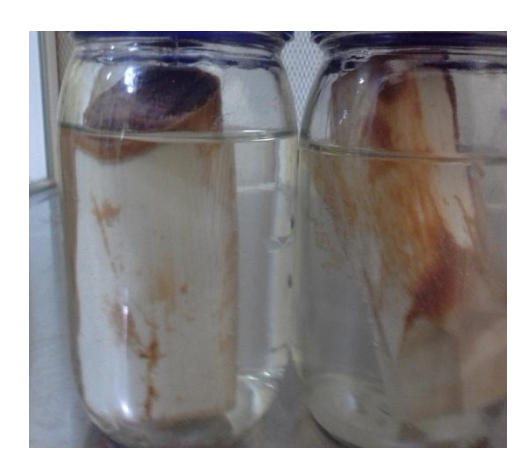
Plate 1b: Explant sterilization using sterilants at different concentrations and timing before inoculation into the media.

The method of Khan and Bibi (2012) was used for explants preparation. This was then treated with different sterilizing agents at different concentrations and timing (Plate 1a and1b).