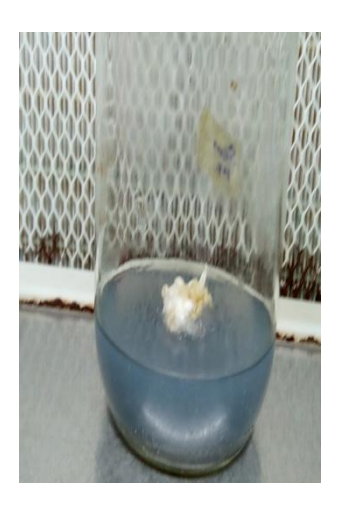
Plate 8: Harvested somatic embryo from callus culture.