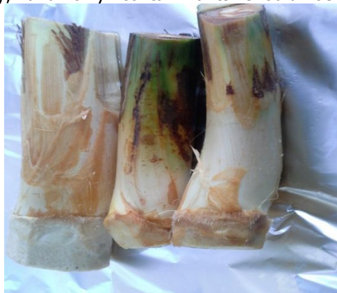
Plate 1a: Excised offshoots under laminar flow condition before commencement of the sterilization procedure

The success of plant tissue culture protocol depends largely on sterilization of the explants. Selection of sterilizing agents and time of exposure is also critical because the living material should not lose their biological activity, and only contaminants should be