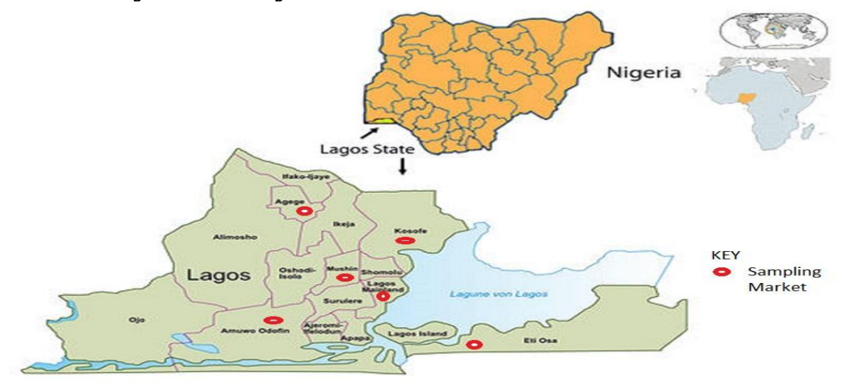
Figure 1: Map of Lagos state, Nigeria showing the sampling sites

market, vegetable samples were collected from three randomly selected sellers. Two composite samples of identical vegetable items (each containing 3 T. occidentalis and 3 C. argentea ) were drawn from each market. The samples were wrapped in aluminium foil according to type, properly labelled, packed in polythene bags, and transported to the laboratory Samples were kept in a freezer at -4°C until required for extraction.