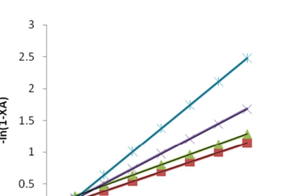
Figure 3: Linearized curve for the determination of reaction rate constant at various temperatures.