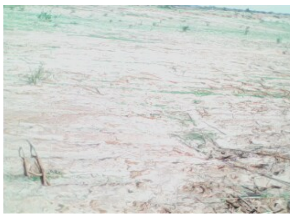
Plate 1: Sheet Erosion in a farm within Gusau area