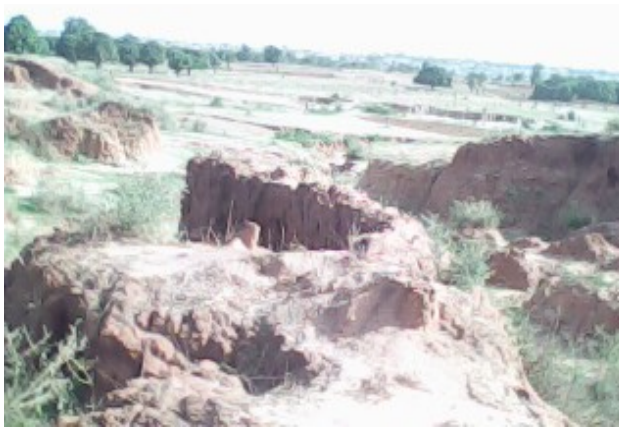
Plate 2: One of the severely eroded farmlands in Gusau area

Particles size distribution (Table 6) of the soil samples in the different land use areas shows a decrease in clay content from the cultivated fields in comparison with the uncultivated eroded field but the silt contents is relatively similar from the entire fields with cultivated field recording high sand content. This finding is in agreement with Kowal and Kassam (1976) who reported that erosion of cultivated soils remove a proportionately greater amount of silt and clay than sand within the savanna regions of Nigeria. The pH values of the soils under the different land use types, were smallest while their exchangeable acidity values (H + Al) are the highest, which clearly indicates that soil erosion has decreased the soil pH. This outcome may have adversely affected crop yield as well as the productivity of the soils in the area. Similarly, the table depicts that eroded soils have the least values of organic carbon in both the surface and subsurface soils which again portrays that soil erosion has adversely affected the soil organic matter content in the soil in contrast with the relatively higher values obtained from other land use types in the study. The low values of organic matter content of the eroded surfaces leads to low porosity, decrease water infiltration, and low cations absorption capacity. The values of available phosphorus (AP) in the