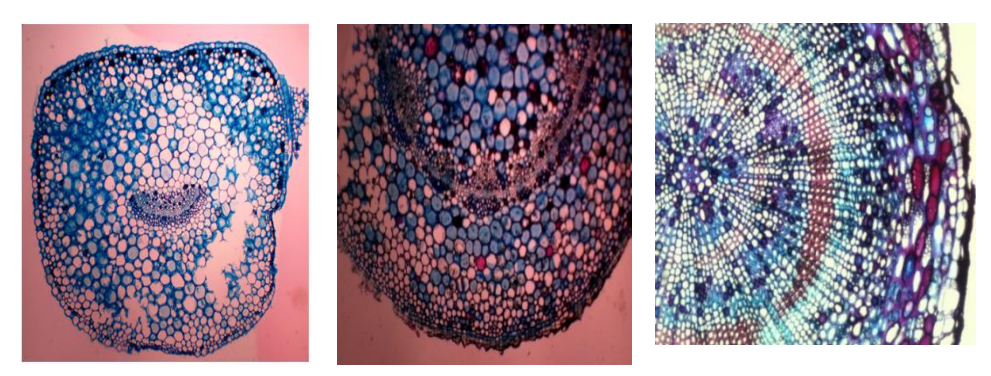
Plate 2: TS of B. pinnatum stem