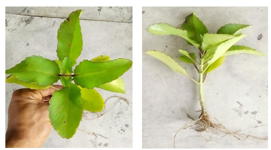
Plate 1: Bryophyllum pinnatum (Lam.) Oken

Proximate Analysis: Proximate analysis (moisture, ash, protein, carbohydrate and lipid content) was determined using standard method (AOAC, 1990). The crude fibre was determined by subtracting difference from others (100 –moisture + ash + protein + carbohydrate + fat content).