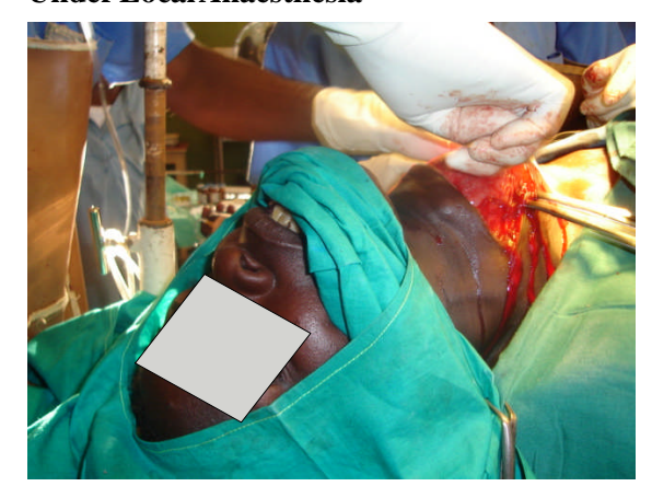
Figure 1: Modified Draping For Thyroidectomy Under Local Anaesthesia