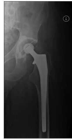
Figure 6: AP Pelvis, showing satisfactory Cemented Left Total Hip Replacement (THR), post-operatively

He was discharged on the fifth day postoperatively and has had several uneventful clinic appointments so far. Histology of the femoral head and hip capsule revealed the presence of numerous inflammatory cell infiltrates, loss of fat cell outlines, widespread marrow edema, numerous tissue histiocytes, and replacement of necrotic marrow by undifferentiated mesenchymal tissue, consistent with osteonecrosis. There was no evidence of metastasis from the prostate cancer, and hence no further radiotherapy was suggested. He also complained of left knee pain, which was confirmed to be due to mild osteoarthritis, and temporarily relieved by intra-articular injection of Marcaine and Domperidone. MRI scan of the neck and spine revealed