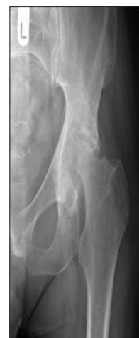
Figure 4: AP Pelvis, showing gross destruction of the left femoral head and acetabulum