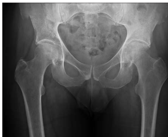
Figure 1: AP Pelvis, showing early destruction (osteonecrosis) of the left femoral head

The patient was, therefore, referred to the oncologists to consider radiotherapy, but they were not convinced that the acetabular lesion was metastatic, as he had no new urinary symptoms, and the Prostate-Specific Antigen