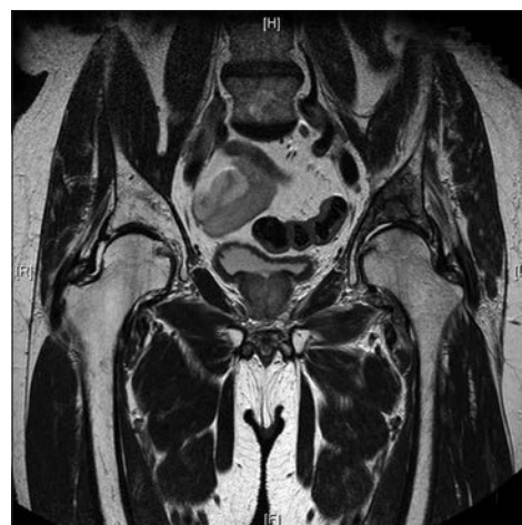
Figure 2: T2 weighted MRI of the Pelvis showing destruction of the left acetabulum and decreased signal in the left femoral head, with marrow oedema