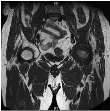
Figure 5: MRI scan showing decreased signal, marrow oedema, and gross destruction of the left femoral head and acetabulum

(PSA) remained normal throughout that period. He was then referred for a technetium bone scan to look for other secondary lesions. A Computed Tomography (CT)-guided biopsy was also arranged to confirm the diagnosis and consider prophylactic fixation or Total Hip Arthroplasty (THA). The bone scan [Figure 3] revealed increased uptake in the left acetabulum and femoral head, in keeping with AVN, but there were no other suspicious areas of increased uptake in the spine or axial skeleton to suggest metastases.