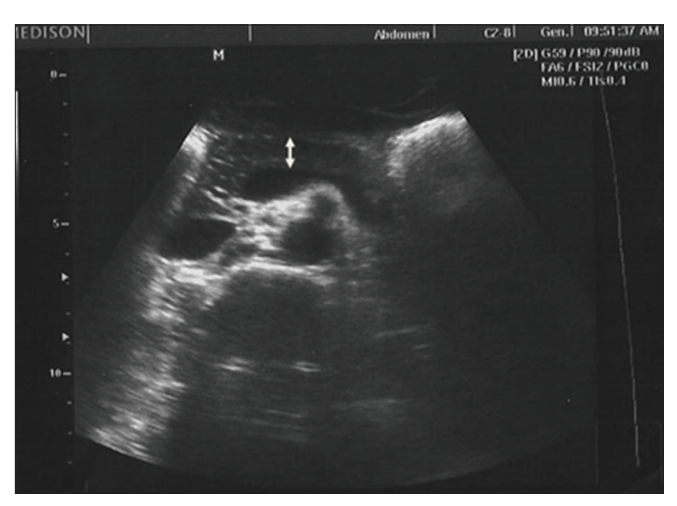
Figure 2: Transverse sonogram of the body of pancreas showing site of measurement