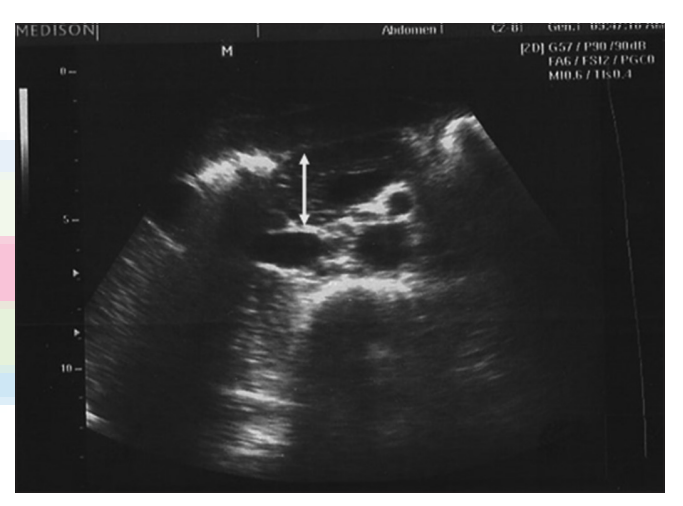
Figure 1: Transverse sonogram of the head of pancreas showing site of measurement

*Significant. n =Number of participants; SD=Standard deviation; BMI=Body mass index