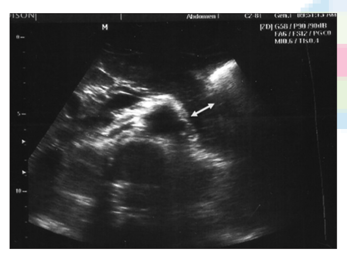
Figure 3: Transverse sonogram of the tail of pancreas showing site of measurement

Statistically significant differences were noted in the AP dimensions of the pancreatic head, body, and tail in