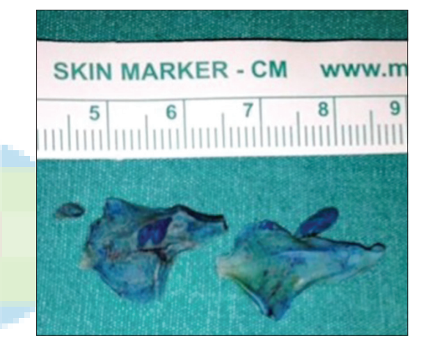
Figure 4: Dental silicone impression material was removed using transnasal endoscopy

Once the soft tissue was removed, the blue rigid material was observed inside the maxillary sinus and removed [Figure 3]. The foreign body was later identified as dental silicone impression material [Figure 4]. Presumably, the dental impression material passed through the oro-antral fistula while in its plastic form, solidified inside the maxillary sinus and triggered a chronic maxillary sinus infection.