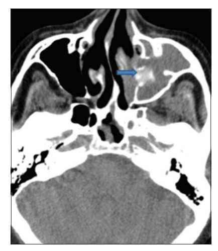
Figure 2 : Axial computed tomography shows a soft tissue density with central calcification completely filling the left maxillary sinus

The maxillary sinus mass and granulation tissue were surgically excised using an endoscopic intraoral approach.