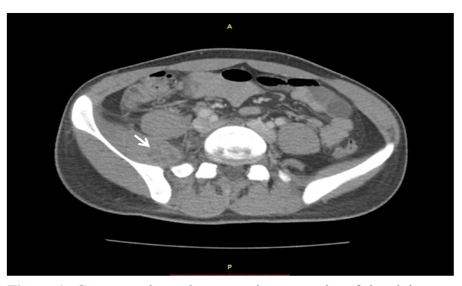
Figure 1: Contrast enhanced computed tomography of the abdomenpelvis showed a right iliacus abscess (arrow).