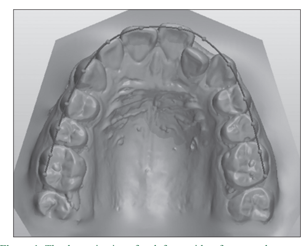
Figure 1: The determination of arch form with software analyze

Changes in mandibular arch width were similar for all treatment groups; however, maxillary arch widths changes varied by group [Table 3]. Differences in