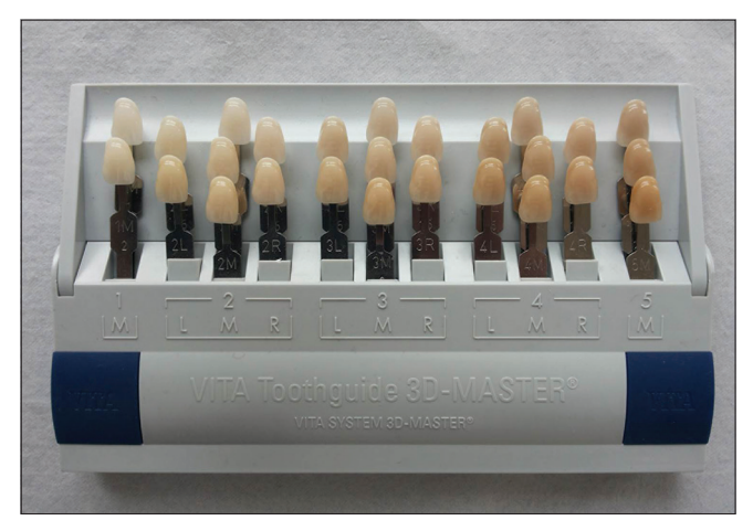
Figure 3: VITA Toothguide three-dimensional-Master scale

differ (P > 0.05) between the groups at any time point [Table 1]. Within each group, there was statistically significant (P < 0.01) discoloration between day 0 and