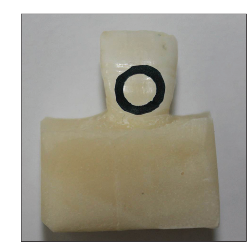
Figure 1: A tooth embedded in a resin block with a standardized circular strip on the buccal surface of the crown

Coronal discoloration was observed in each group over time; however, color shade did not significantly