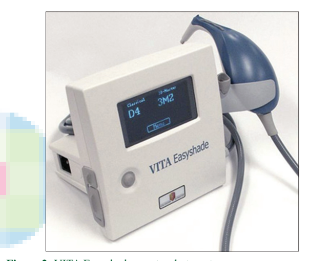
Figure 2: VITA Easyshade spectrophotometer