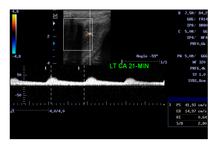
Figure 2: Doppler sonogram of the left cavenorsal artery 21-min post injection of papevarine, showing a persistently elevated EDV (14.32 cm/s)

cavernosography was obtained following the preliminary film and intracavernosal injection of contrast medium and papevarine [Figure 3].