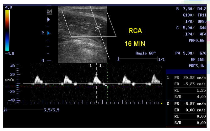
Figure 1: Doppler sonogram of the right cavenorsal artery 16 min post injection of papevarine, showing a PSV of 20.92 cm/s

Twenty-one patients who were referred from urology clinics on account of suspected vasculogenic erectile dysfunction within an 18-month period (from October 2013 to March 2015) were reviewed. The cavernorsal arteries were examined with 7.5 MHz linear transducer in gray scale and duplex Doppler modes before and after intracavernosal injection of vasodilator (60 mg papevarine). Serial peak systolic velocity (PSV), end diastolic velocity (EDV), and diameter measurements at 2, 5, 10, 15, 20, 25, and 30 min were obtained. A PSV of less than 25 cm/s was considered to be the threshold for arterial insufficiency [Figure 1]. An EDV of ≥5 cm/s 15 min post injection was used to predict venous incompetence [Figure 2]. Contrast