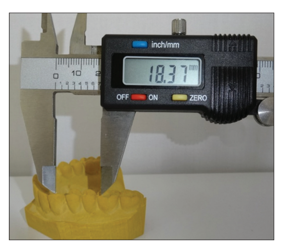
Figure 3: Linear measurements with digital calipers on the plaster model

P measurements at T (1) and T (2) time groups were statistically significantly different from each other in the positive digital models (P < 0.001). RC-RM, RC-LC, and LM-LMG measurements did not show significant differences between the time groups [P > 0.05; Table 6].