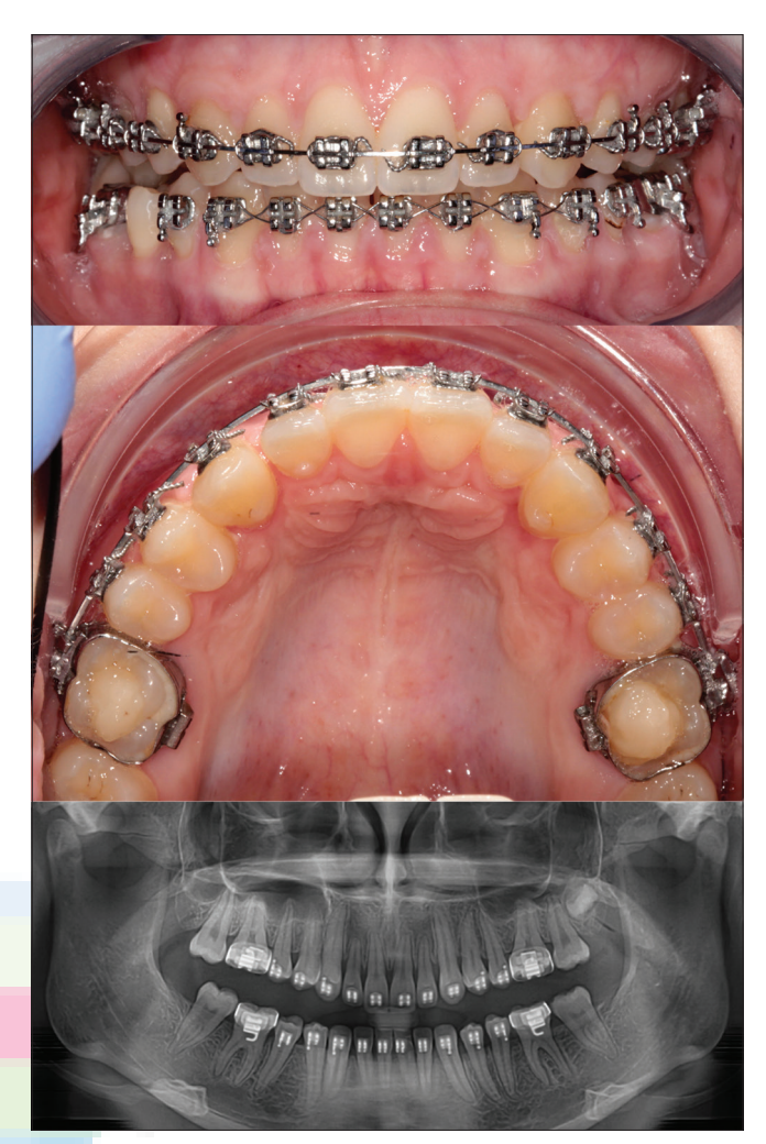
Figure 2: With the help of the mini-screws, the normal occlusion including the normal position of the canines was constructed after 26 months of orthodontic treatment

During the research period, neighboring tooth root injury was not detected on radiographs or CBCT images, and screw removal was not indicated. In case of screw mobility, radiographic examinations showed increased radiolucency around the screws in 6 from the 6 cases