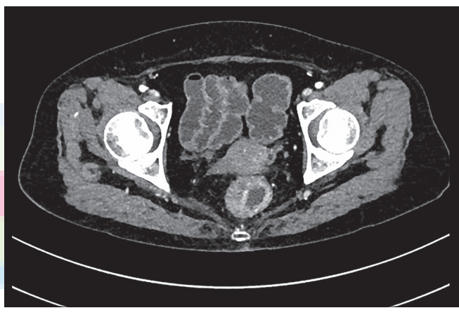
Figure 1: The walls of rectum were unevenly thickened and enhancement

IgA=Immunoglobulin A; IgG=Immunoglobulin G; EBC=Epstein-Barr Virus; INF=Interferons; TB=Tuberculosis; GBM=Glomerular basement membrane; KAP=Kinase activator protein; LAM=Lipoarabinomannan; CA= Cancer antigen; T-SPOT=Enzyme-linked immunospot assay; IGRA=Interferon Gamma Release Assay