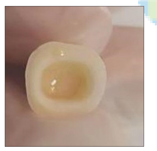
Figure 4: Endocrown preparation and light-curing resin-modified glass-ionomer which was used for closing the orifice of the canal is seen