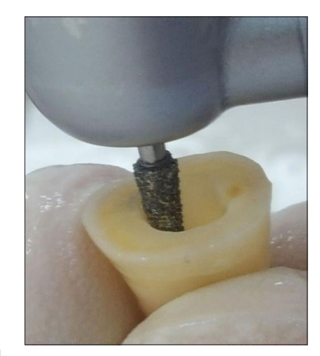
Figure 2: Preparation of axial walls of the pulp champer is seen