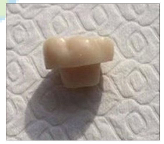
Figure 5: Lithium disilicate ceramic endocrown is seen

Endocrowns appear to be the best choice for restoring endodontically treated posterior teeth with inadequate remaining coronal structure, especially molars. The clinical success of molar endocrowns was better than that of premolar endocrowns.<sup>[11]</sup> Bindl et al. <sup>[11]</sup> evaluated the survival rate of cerec endocrowns for premolars