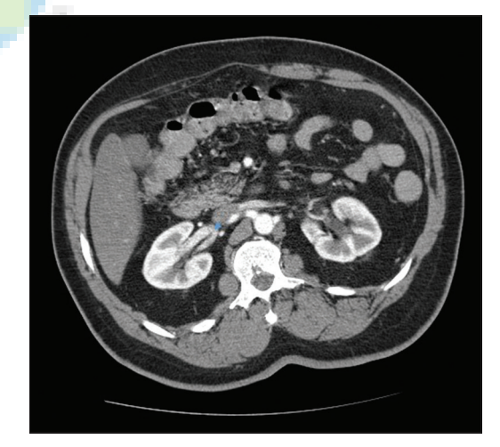
Figure 5: Late arterial phase axial view of late confluence of the renal vein on the right (arrowhead)

seen in 4.5%. 7 of the 9 precaval renal arteries (77.8%) were accessory arteries to the right lower pole. Early renal arterial bifurcation was significantly more common on the right side (P = 0.016). Of the arterial variants, the inferior polar accessory artery was the most prevalent (15.5%) and was also more commonly seen on the left side.