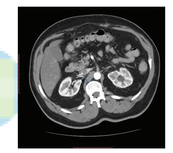
Figure 2: Axial arterial phase image of early branching of R renal artery posterior to the inferior vena cava (arrow)