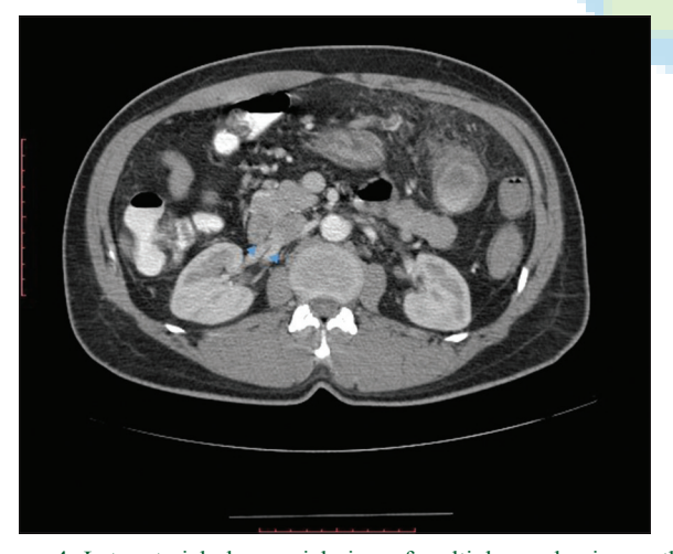
Figure 4: Late arterial phase axial view of multiple renal veins on the right (arrowheads)

seen in 4.5%. 7 of the 9 precaval renal arteries (77.8%) were accessory arteries to the right lower pole. Early renal arterial bifurcation was significantly more common on the right side (P = 0.016). Of the arterial variants, the inferior polar accessory artery was the most prevalent (15.5%) and was also more commonly seen on the left side.