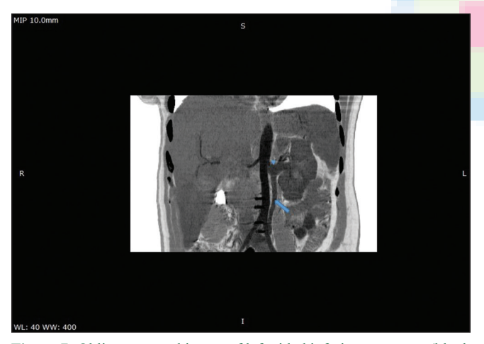
Figure 7: Oblique coronal image of left-sided inferior vena cava (block arrow) showing its confluence (arrowhead) with the left renal vein

Apart from early arterial branching, the vascular variants showed no statistically significant association with laterality. Gender distribution of the observed variants is as shown in Table 1.