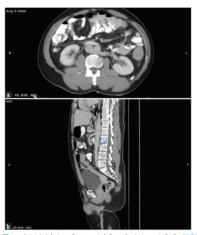
Figure 6: (a) Axial view of retroaortic left renal vein (arrow). (b) Sagittal view of retroaortic renal vein seen as a density projected between and the aorta and the 3<sup>rd</sup> lumbar vertebral (arrow)