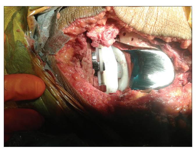
Figure 5: The implanted knee before wound closure