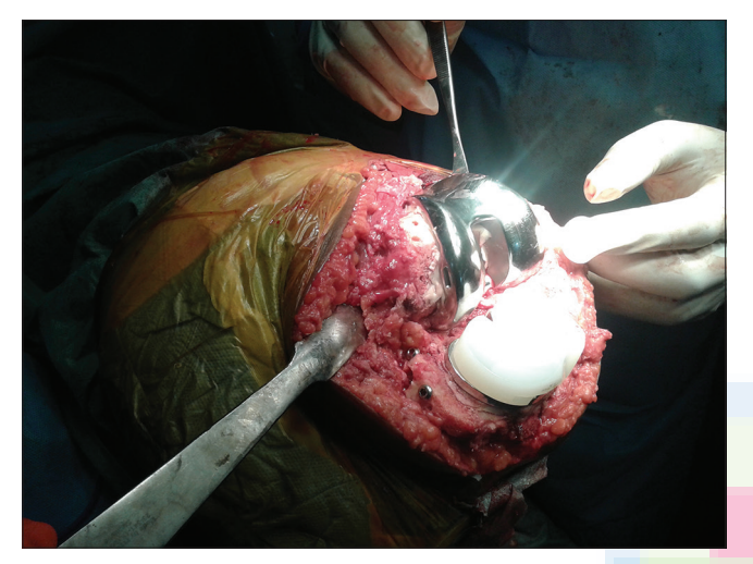
Figure 4: Completion of implantation