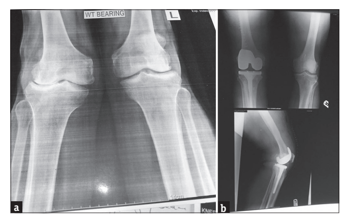
Figure 1: (a) Preop Xray of a patient who had undergone a TKR. Note the extensive sclerosis which had compromised the primary zone of fixation hence the use of extension rod in this case. (b) Post op Xray of a patient who had undergone a TKR. Note the use of extension rod to overcome the compromised primary zone of fixation