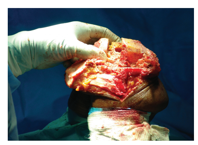
Figure 3: The completed notch box cut.