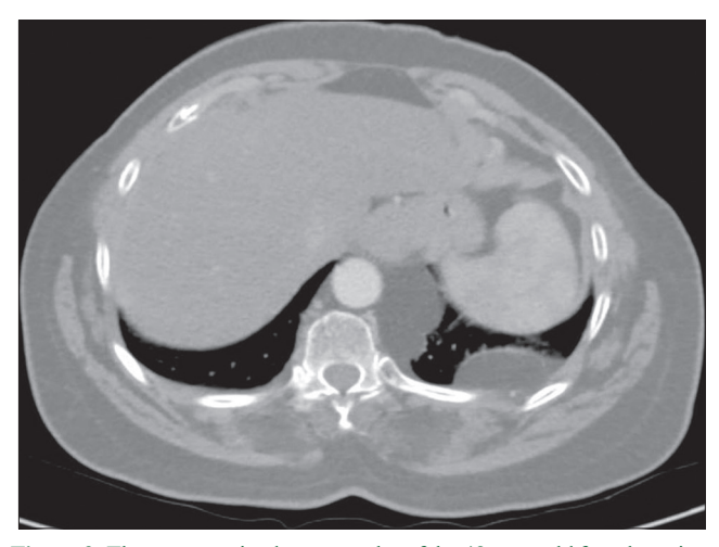
Figure 3: The computerized tomography of the 48-year-old female patient demonstrates a homogenous formation with a size of 44 \times 21 mm and a fat density in the paravertebral and posterior regions, close to the left diaphragmatic level

Their mean age at presentation was 62.7 years. The tumors of four asymptomatic patients were incidentally detected by chest radiography. According to body mass index analysis, no patient was obese but there were four overweight patients. No abnormality of laboratory studies was noted in any patient. All lesions were assessed using plain chest films and computed tomography (CT) of the chest [Figure 1]. In two cases, where no contrast uptake was evident in the lesions in the postcontrast images after chest CT, magnetic resonance imaging (MRI) was performed to assess both lesion homogeneity and internal fat tissue [Figure 2]. Seven patients had a well-demarcated shadow of a homogenous lesion on chest X-ray. CT of the chest revealed a tumor with a well-distinguished borders and a homogenous fat density [between -50 and -150 Hounsfield unit (HU)], which was compatible with subcutaneous fat. In radiological examination, the lesion was located