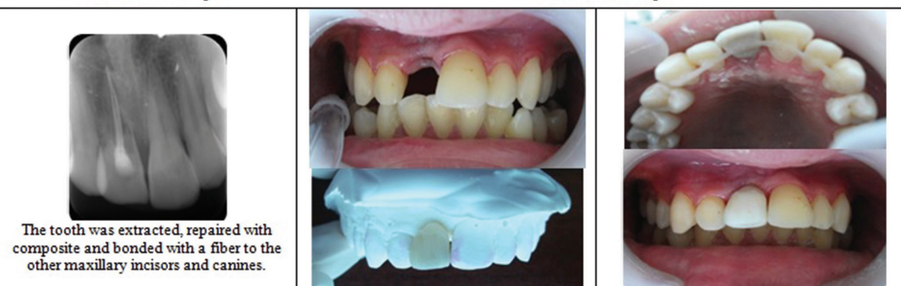
Figure 3: Radiographic and clinical records of case 6