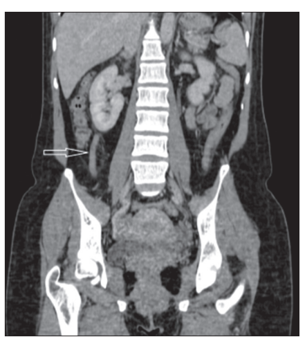
Figure 3: Appearance of the appendix, which has increased in diameter and causes inflammation in the surrounding fatty tissue, on abdominal CT (indicated by arrow)