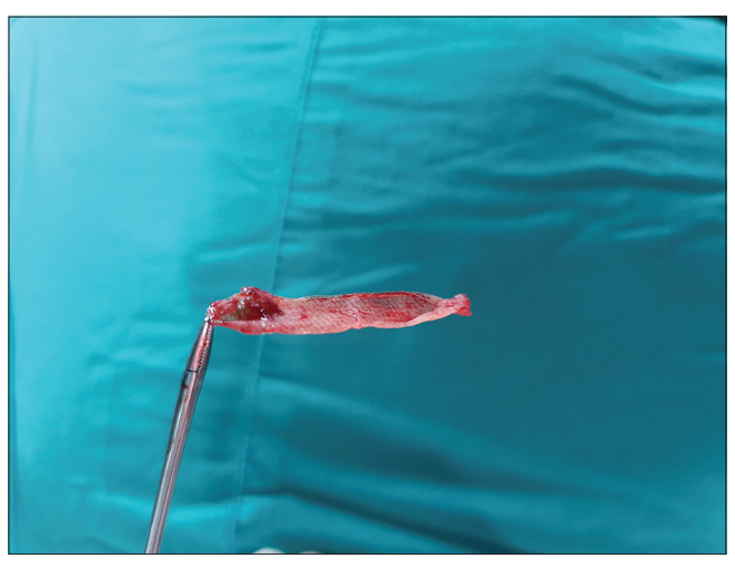
Figure 2: Pressed platelet-rich fibrin