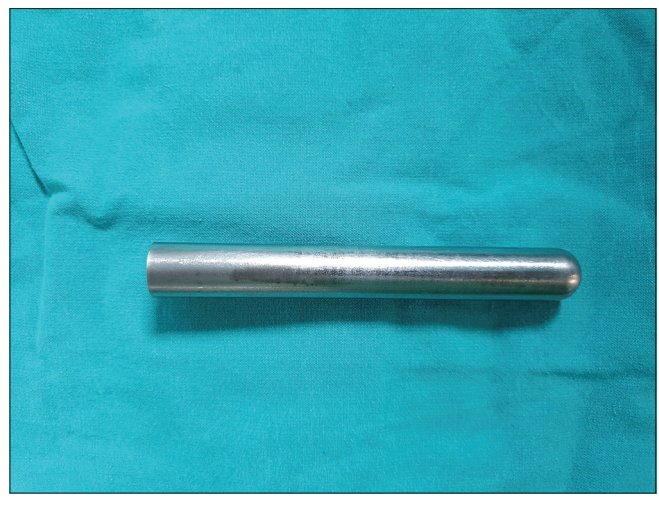
Figure 1: Titanium-coated tube