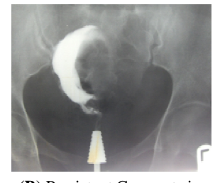
(B) Persistent Crescent sign