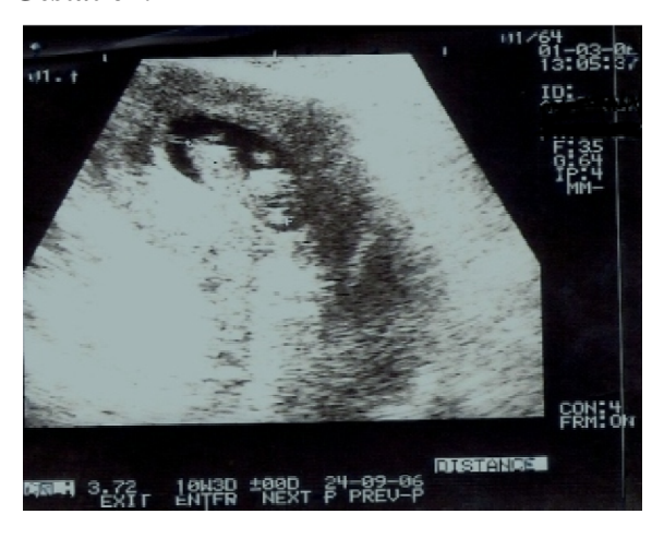
Figure 2: Pelvic Scan Showing a Single Viable Active Intrauterine Fetus of About 10 Weeks Gestation.

Subsequently, the procedure was terminated and follow-up scans were recommended until delivery. The follow up scan done at 20 weeks to assess for morphological anomaly showed no abnormality. She had an uneventful antenatal care and delivery. A normal female, term fetus weighing 4.3kg was delivered seven months after the HSG at approximately 41weeks, based on the ultrasound dating on the day of the HSG.