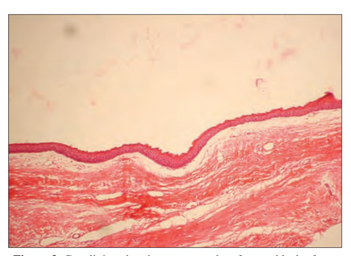
Figure 3 : Cyst lining showing corrugated surface and lack of rete ridges (H and E, ×40)