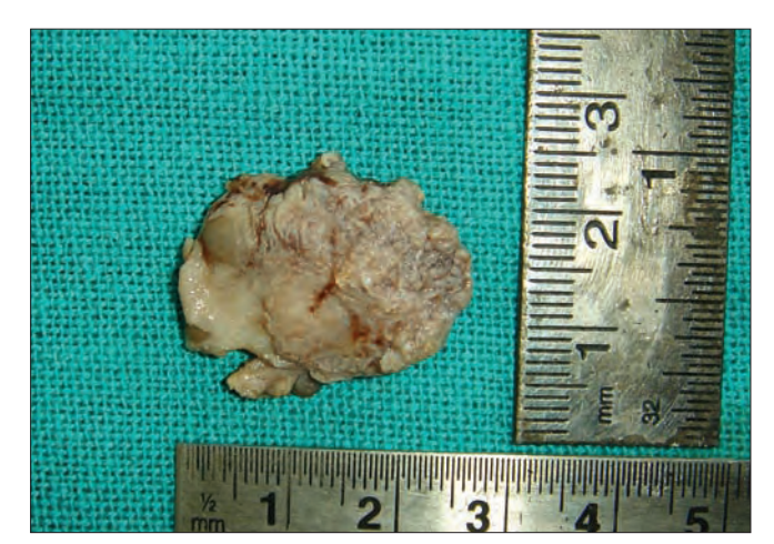
Figure 2: Gross specimen

Among all the jaw cysts, OKCs have received special attention in the literature because of their relatively high recurrence rate and also due to their tendency to grow within the medullary spaces of the bone in the anteroposterior direction. This growth pattern rules out the possibility of the detection of these lesions at an early stage. On rare occasions, this cyst can occur in the soft tissues, when it