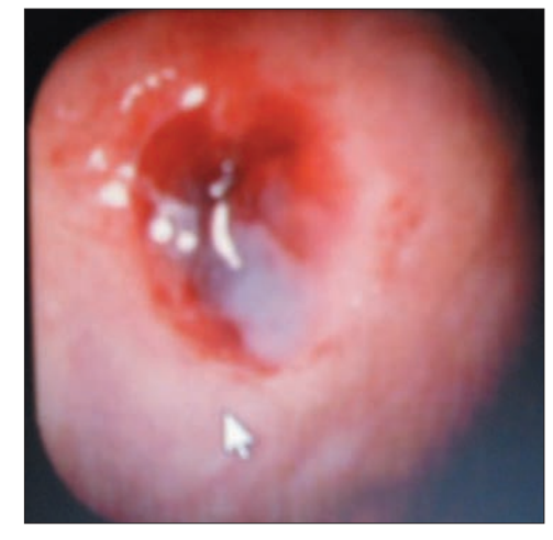
Figure 3: An area of mucosa blood clot (angiodysplasia) in the colon

bleeding in the elderly above 65 years of age. Cases of angiodysplasia in individuals less than 40 years have been documented in the literature.<sup>[5,10]</sup> It may be asymptomatic, or present with iron deficiency anemia or positive occult