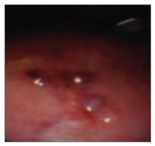
Figure 1: Dilated and tortuous blood vessels in the colon

Angiodysplasia though rare in this part of the world, is known to be one of the commonest causes of lower GI