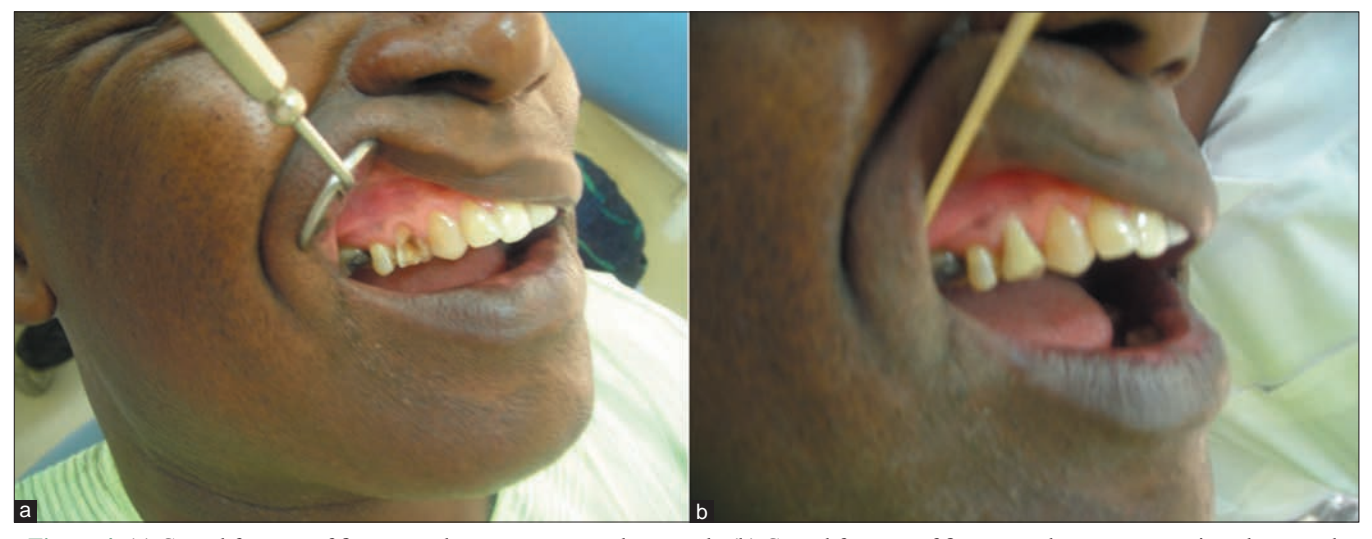
Figure 4: (a) Cuspal fracture of first premolar: pretreatment photograph. (b) Cuspal fracture of first premolar: postrestoration photograph

attributed to RTA in this study; this is much higher than 1.5% recorded by Al-Jundi<sup>[20]</sup> who studied patients with age range 15 months to 14 years. This could be explained by the fact that many in Nigeria at this age (adult population) are involved in pursuit of career, academics, economic activities,