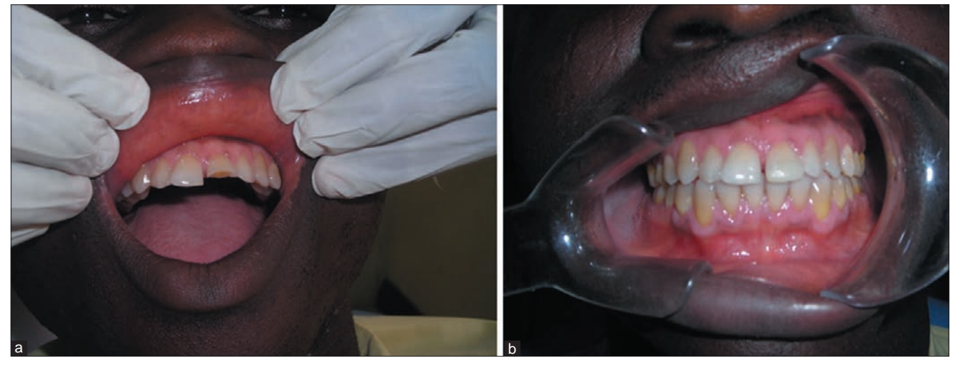
Figure 3: (a) Enamel-dentine fracture of a central incisor. (b) Enamel-dentine fracture of a central incisor following restoration