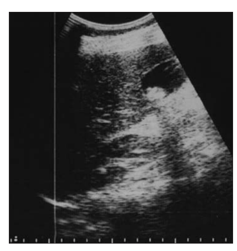
Figure 1 : Ultrasound of the gall bladder showing a calculus in the gall bladder with posterior acoustic shadowing

All the patients were scanned using an ALOKA SSD-1700 ultrasound machine with a variable frequency transducer. Scanning was done in both transverse, longitudinal, and any other plane deemed necessary to adequately visualize the GB and biliary ducts. On USS, GS is seen as a reproducible