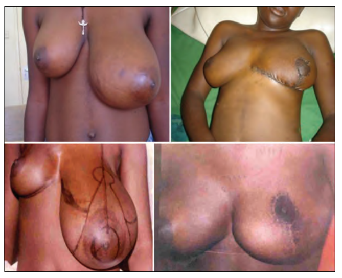
Figure 2: Pre and post operative results of two representative cases

Not all GFA can be adequately treated by simple enucleation and reliance on soft-tissue shrinkage for symmetry with the opposite breast. [2] It was therefore important to select those