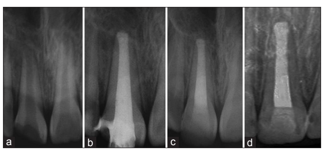
Figure 1: Radiographs of tooth 11 treated with mineral trioxide aggregate (a) Preoperative radiograph (b) Postoperative radiograph (c) 12-month follow-up (d) 24-month follow-up