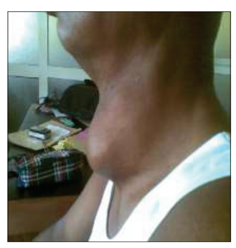
Figure 1: Hard nodular enlargement of left thyroid lobe at presentation: Lateral view