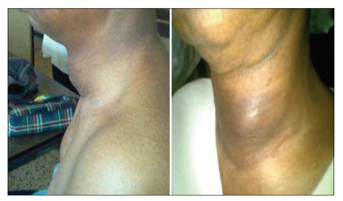
Figure 3: Same patient 6 months after commencement of oral prednisolone