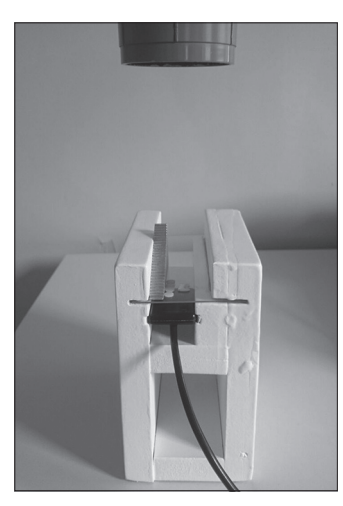
Figure 1: Front view of experimental set-up, which keeps the head of the X-ray central beam at 30 cm and at a 90° angle to the surface of CCD sensor

Restorative materials should ideally be radiopaque to enable visualization and assessment by radiograph, and all newly developed materials should, therefore, be investigated in this respect.<sup>[19]</sup> Bulk fill flowable resin composite restoratives