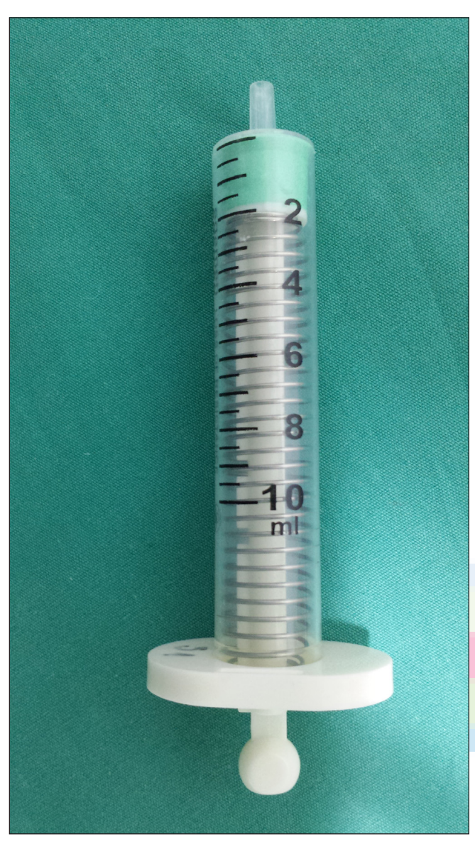
Figure 3: Epi-Jet syringe view. When installed in spring can be obtained positive pressure

Kartal, et al.: Epidrum®, Epi-Jet® and Epidural Anesthesia