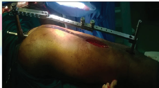
Figure 1: Antegrade approach: External jig attached to the inserted nail in antegrade approach

The union rate of femoral shaft fractures in this study was 95.3%. The mean time to radiological union was 14.0 \pm 1.2 weeks, with a range of 11–16 weeks. The mean time to painless full weight bearing was 14.2 \pm 1.2 weeks, with a range of 11–16 weeks.